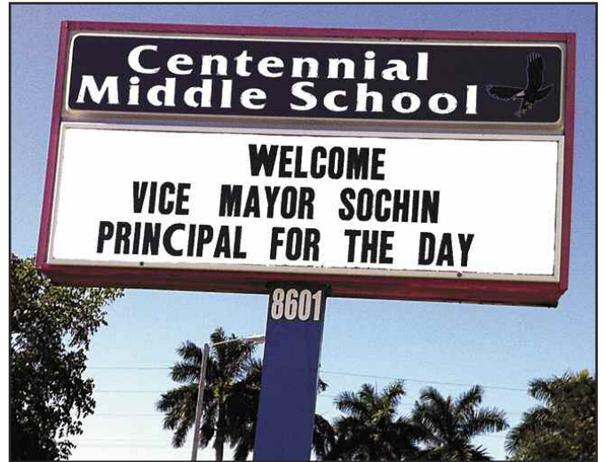
My name up on the marquee

Now the teachers: What a bunch of dedicated people I got to see in action there. It kind of reminded me of my school days back in the Neanderthal era in Boston, where teachers weren't allowed to be married (no kidding) so