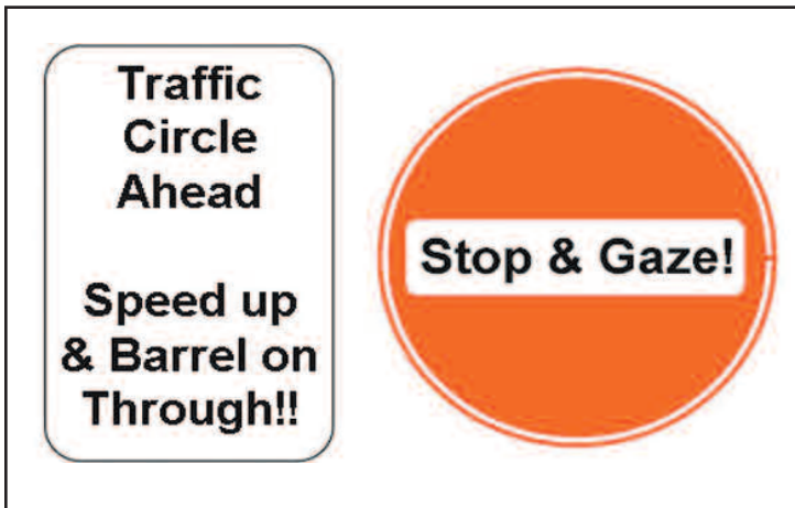
Shown are two prospective traffic sign designs by DDOC (Dade Department of Circles).